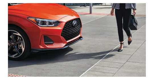
Forward Collision-Avoidance Assist with Pedestrian Detection