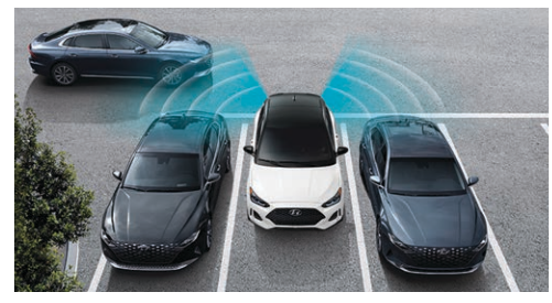
Rear Cross-Traffic Collision Warning

To ensure you experience exactly the driving feel you desire, Veloster comes with a feature called Drive Mode Select. With the press of a button, it allows you to adjust the shift points and steering feel to one of three modes – Normal, Sport and Smart.<sup>1</sup> Of course, driving is not all fun and games. Which is why Veloster prepares you for the road with Hyundai SmartSense, a suite of advanced safety features that includes systems designed to alert drivers to potential hazards – and actively assist to help keep you out of harm's way.<sup>2</sup>