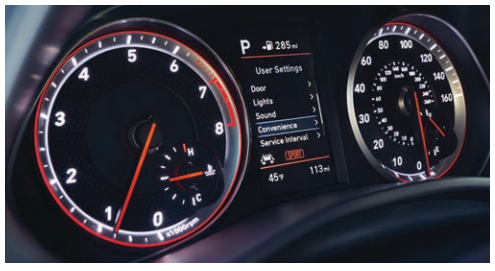
Turbo instrument cluster