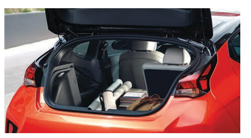
60/40 split fold-down rear seats