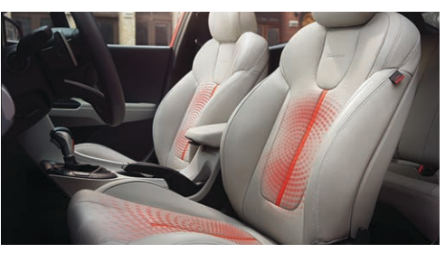
Heated front seats