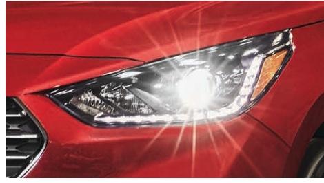
LED headlights and Daytime Running Lights