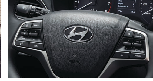
Steering wheel audio and cruise controls