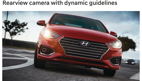
Vehicle Stability Management