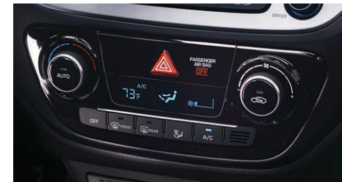
Automatic temperature control